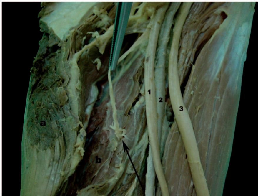
Fig 1 Left upper limb. The long head of the triceps muscle (a) is cut in order to see the medial head (b) and shows the branch (arrow) of the ulnar nerve (1) entering into the medial head of the triceps muscle. Anterior to the ulnar nerve, the brachial artery (2) and the median nerve (3) are seen.

There are several examples of upper limb muscles that are supplied by other than the usual nerves, such as the brachial muscle, which can have a double innervation