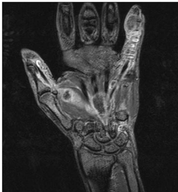
Fig 1 MR image of tuberculous tenosynovitis involving the thumb and small fingers. Note the extensions to the wrist.